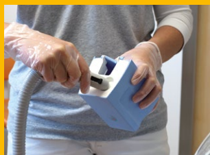
3. Suck off, 200 ml each