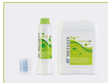
GREEN&amp;CLEAN RD N

Alcohol-free concentrate for disinfecting surfaces of medical devices (e.g. alcohol-sensitive surfaces of the dental unit)