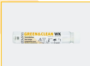
WK TEST STRIPS

GREEN&CLEAN WK test strips are used to conduct a visual inspection of the functionality and the effectiveness of the water decontamination system