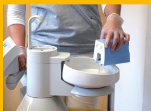
4. Pour remaining liquid into cuspidor, 200 ml