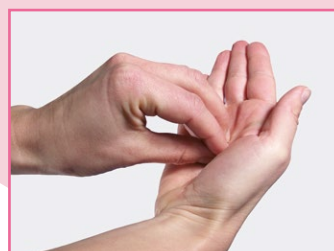
6. Finger tips on palm