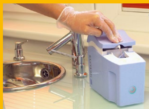
1. Dispense, 6 ml