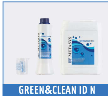
GREEN&CLEAN ID N