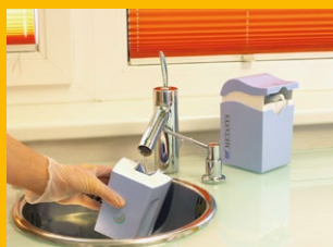
2. Dilute with water, 600 ml