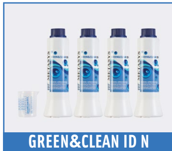
GREEN&CLEAN ID N