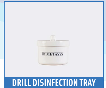
DRILL DISINFECTION TRAY