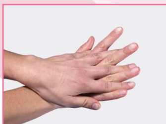
3. Palm on back of the hand with spread and interlocked fingers